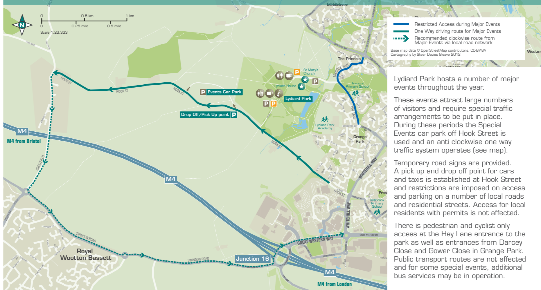
See map overleaf for key and normal traffic arrangements

Lydiard Park hosts a number of major events throughout the year.