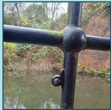
Mouse & snail on railings