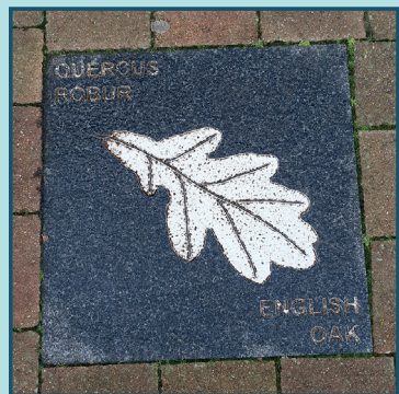
Leaf prints on pavement