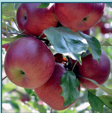
A Fruit tree