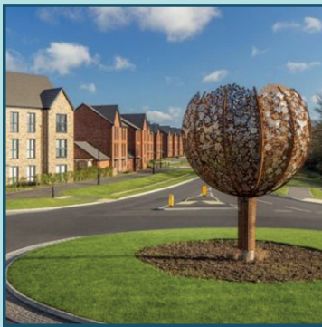
Tree of Life