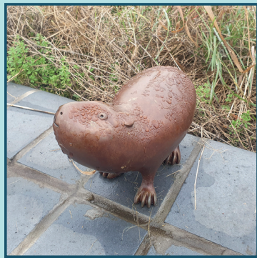
Water Vole & the Waders