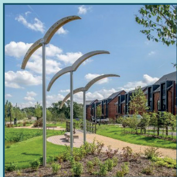
Birds in flight