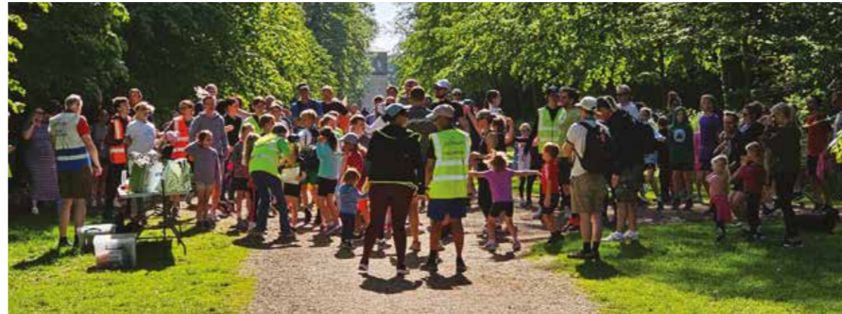
The junior parkrun setting off close to Lydiard House

www.lydiardpark.org.uk E: lydiardpark@swindon.gov.uk T: 01793 466664 @lydiardpark